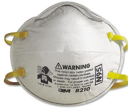
Left: Surgical/procedure mask. Right: N95 respirator